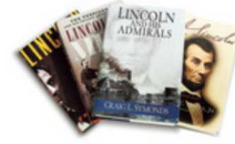
Abe Lincoln as He Really Was