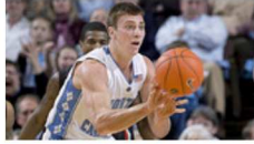
Why Carolina Owns College Hoops