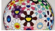
Contemporary Auctions Bring Jitters