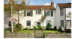
Homes Near World-Class Restaurants