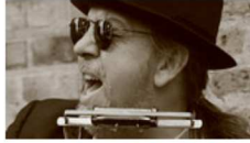
Songwriters Take On the Recession