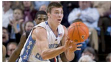
Why Carolina Owns College Hoops