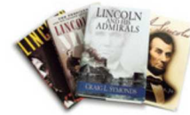
Abe Lincoln as He Really Was