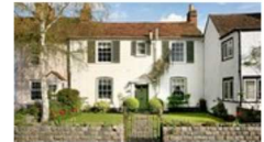
Homes Near World-Class Restaurants