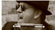
Songwriters Take On the Recession