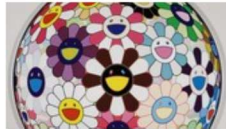
Contemporary Auctions Bring Jitters